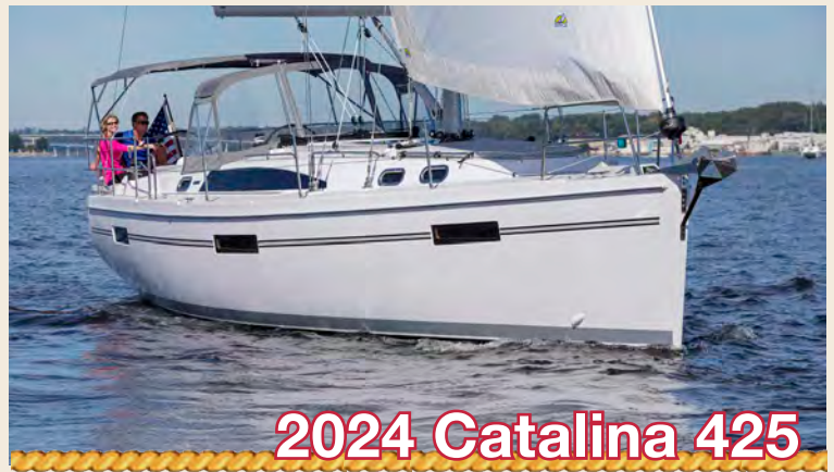
2024 Catalina 425