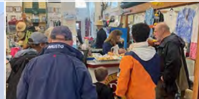
Boat Lovers Day is May 3