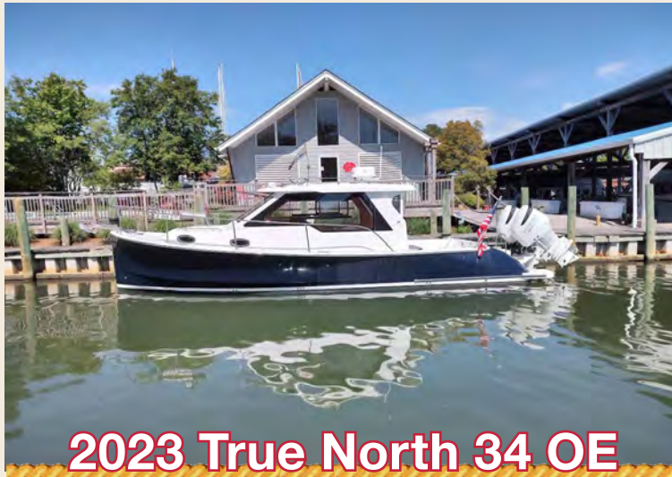
2023 True North 34 OE

Schedule a Sea Trial today 804-776-9898 or info@dycboat.com . ⚓