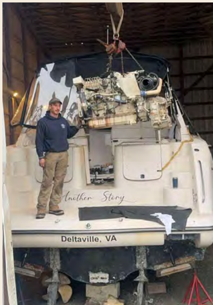
REINSTALLING AN ENGINE AFTER REPLACING THE TRANSMISSION ON A MAXUM 41.