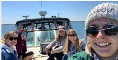
Faces of Boating