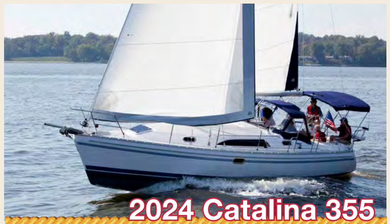
2024 Catalina 355