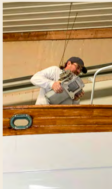
WINDLASS MOUNT FABRICATION & WINDLASS INSTALL ON A HANS CHRISTIAN 43.