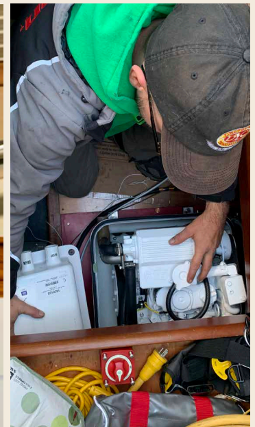
NEXTGEN 3.5KW UCM1-3.5SE INSTALL ON A BENETEAU 43.